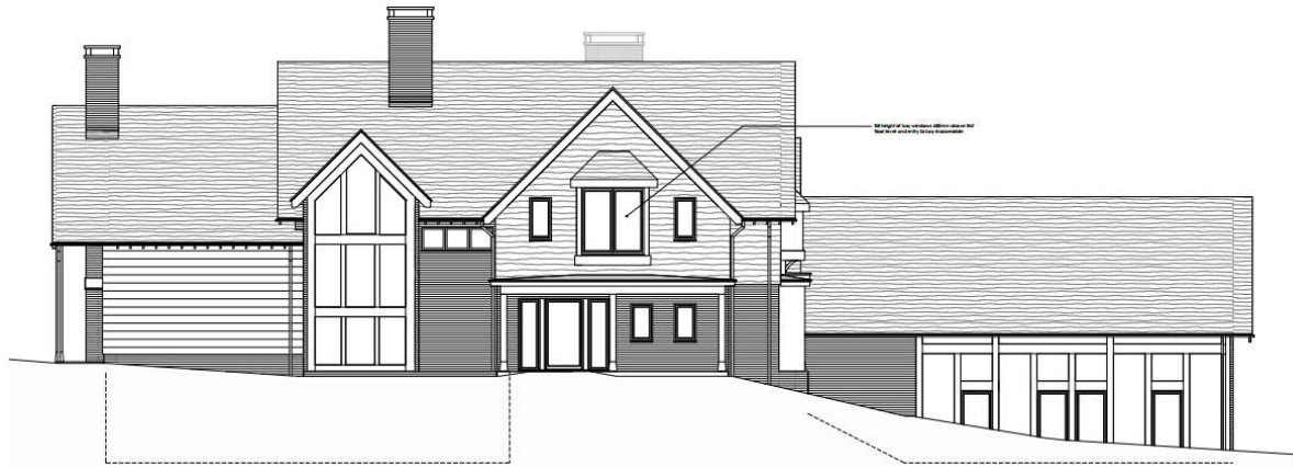
EAST ELEVATION 1:50